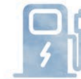
Panel Ready For Electric Vehicle Charging