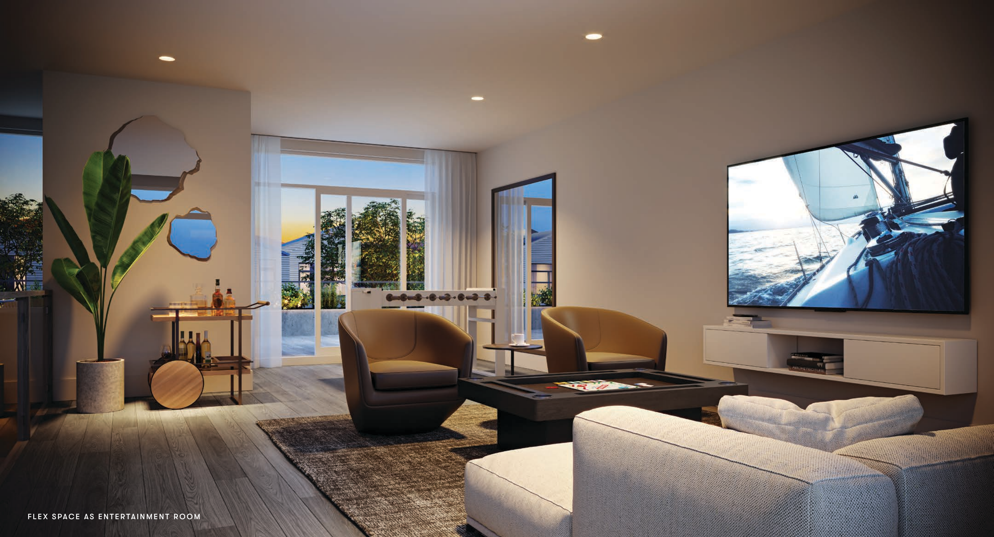
FLEX SPACE AS ENTERTAINMENT ROOM