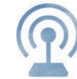
High Speed Internet