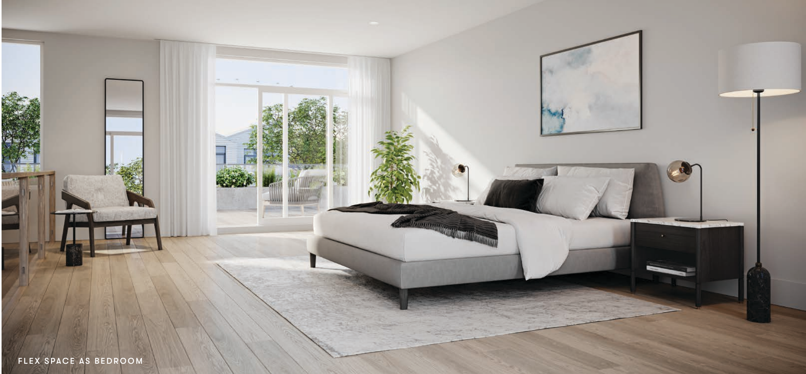
FLEX SPACE AS BEDROOM