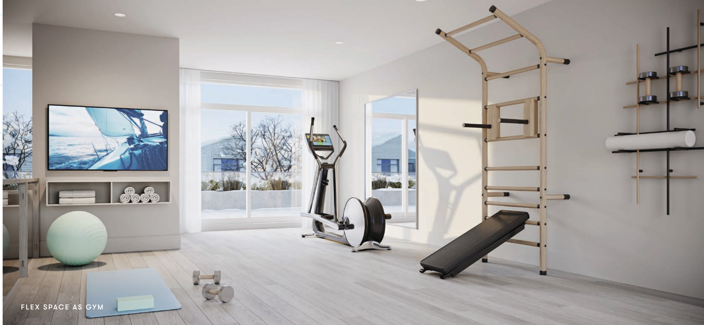
FLEX SPACE AS GYM