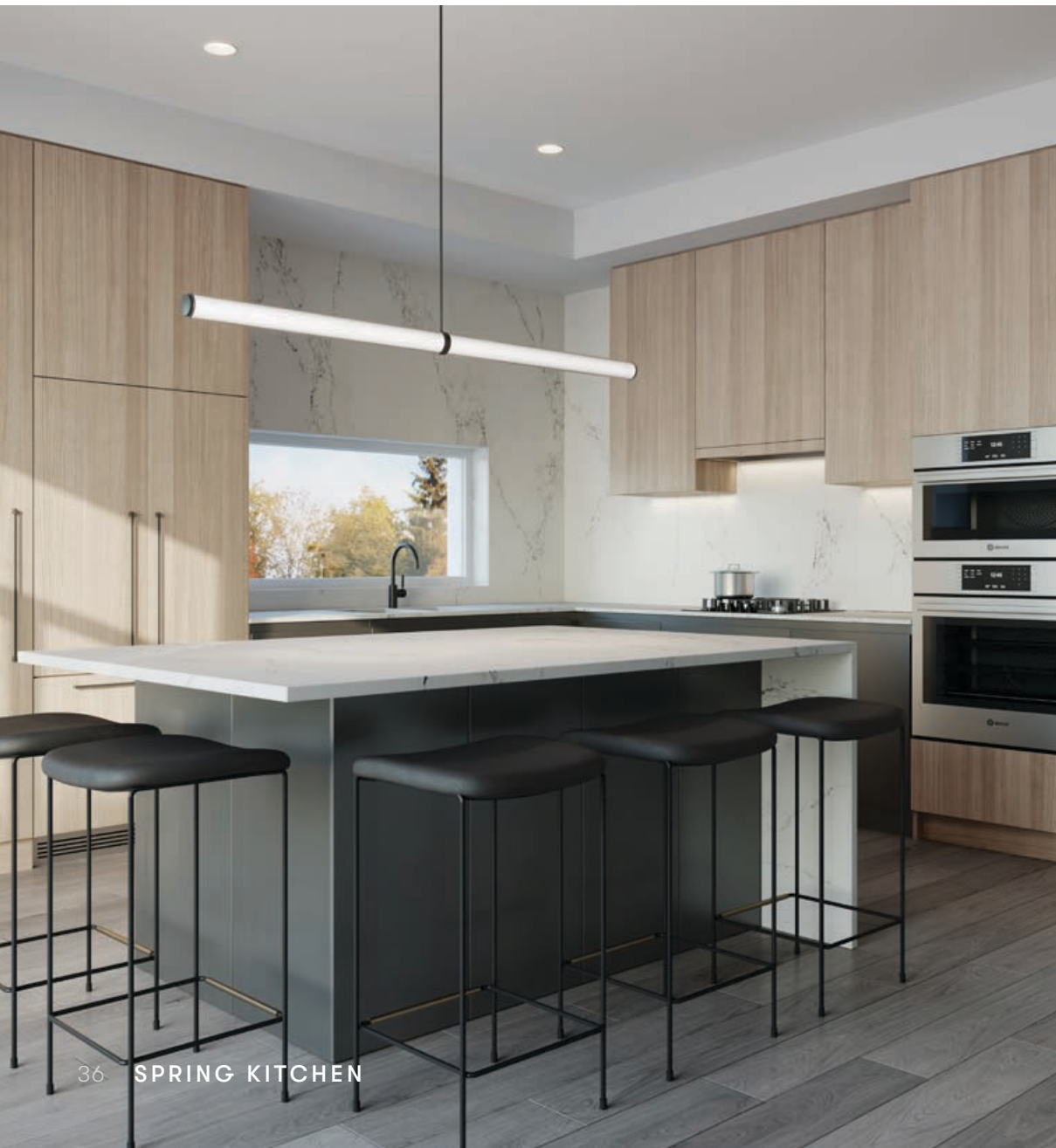
36 SPRING KITCHEN

modern home automation packages, central air, gas connections for BBQs on the main floor deck, oak stairs with glass guardrails, a rooftop terrace, and multiple car parking. Sustainable building designs, ENERGY STAR™ Bosch appliances and Fisher and Paykel refrigerator, modern innovations, and so much more make your new home at Brightwater feel like your own private oasis amongst the holiday-like setting of Port Credit's most exciting waterfront community.