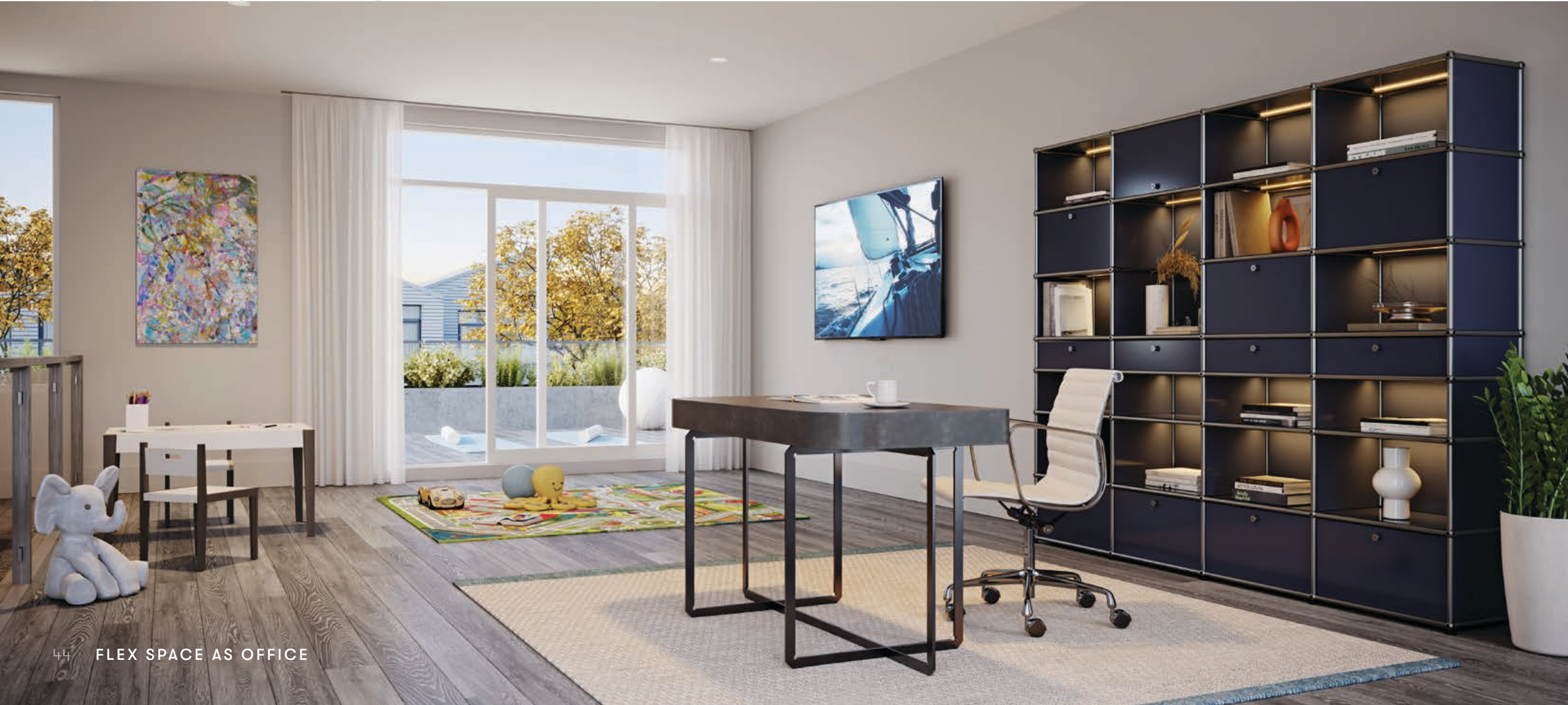
44 FLEX SPACE AS OFFICE