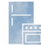
ENERGY STAR™ Bosch appliances & Fisher and Paykel fridge