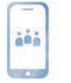
Community Connect Mobile App