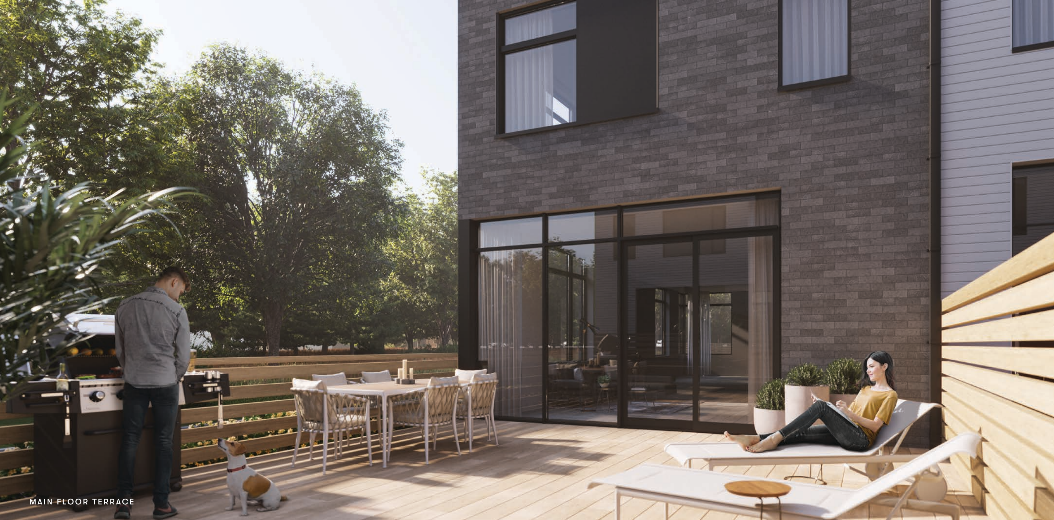
MAIN FLOOR TERRACE