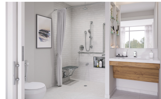
Roll-in shower example