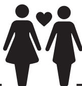
Illustration is artist's concept. E. & O. E.