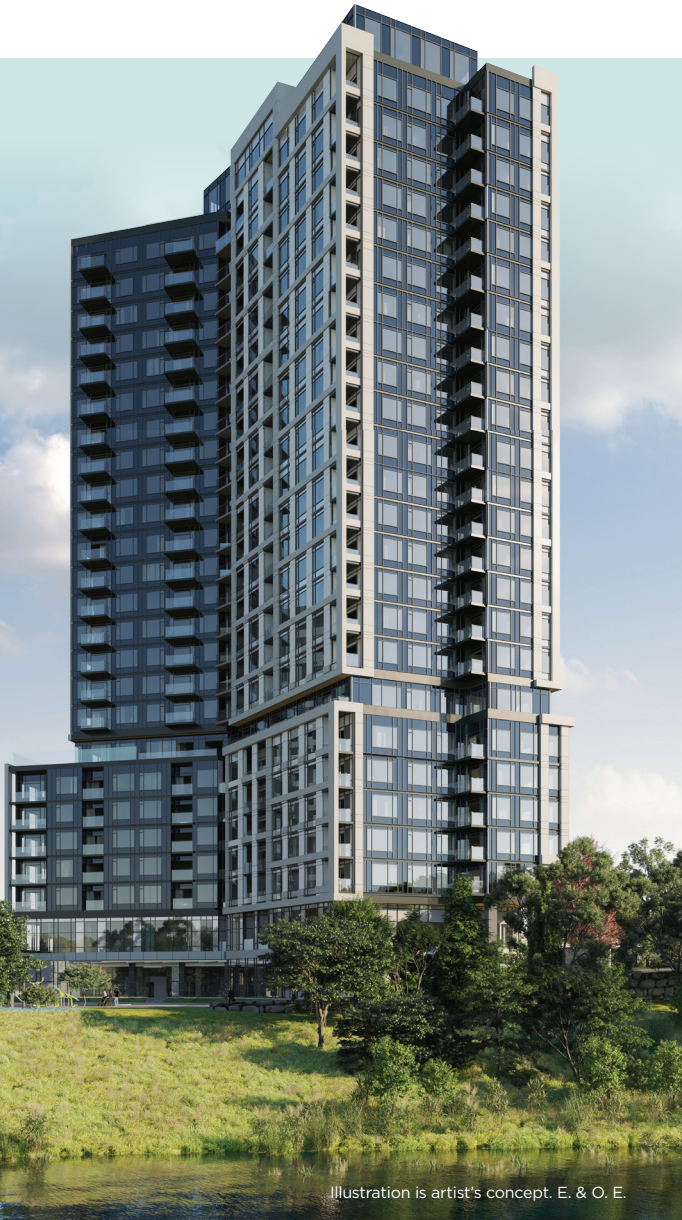
Illustration is artist's concept. E. & O. E.