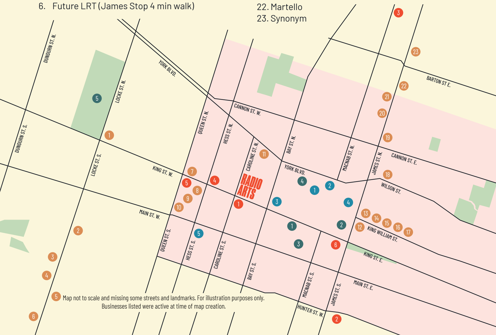
Map not to scale and missing some streets and landmarks. For illustration purposes only. Businesses listed were active at time of map creation.