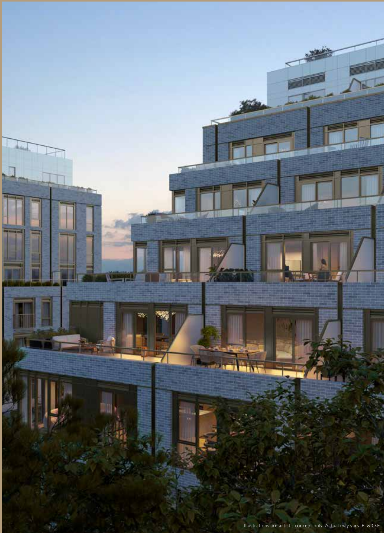
Illustrations are artist's concept only. Actual may vary. E. & O.E