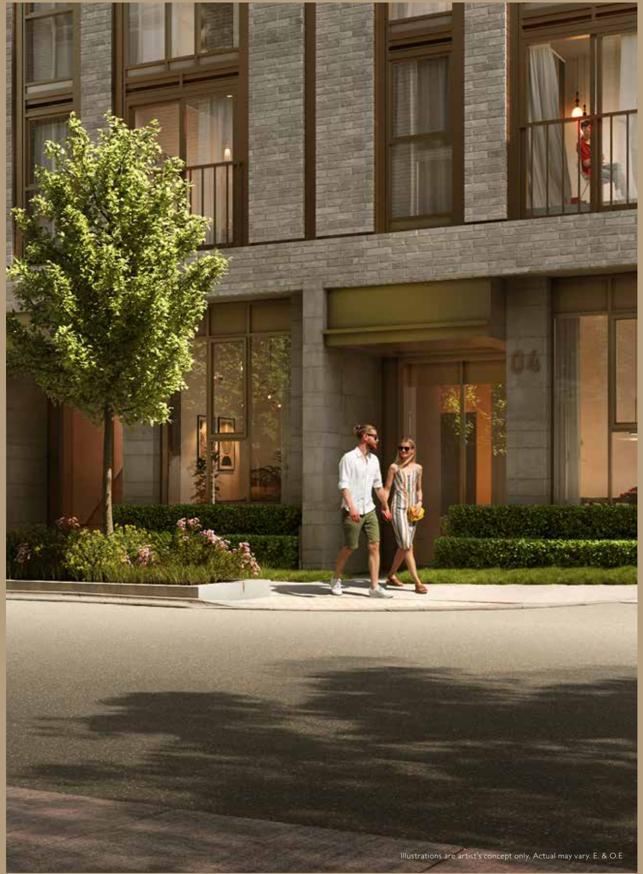
Illustrations are artist's concept only. Actual may vary. E. & O.E

Exhibiting contemporary flair and timeless elegance, The Leaside's two opulent buildings stand side by side, lavishly embellished with gold accents. The architects of Turner Fleischer have designed The Leaside to be an integral part of the neighbourhood, embodying the values of discrete luxury and attention to detail. The two lovely buildings face the street in all their glory, offering a feeling of comfort amidst the creativity of architecture that serves to enhance and meld with the illustrious area.