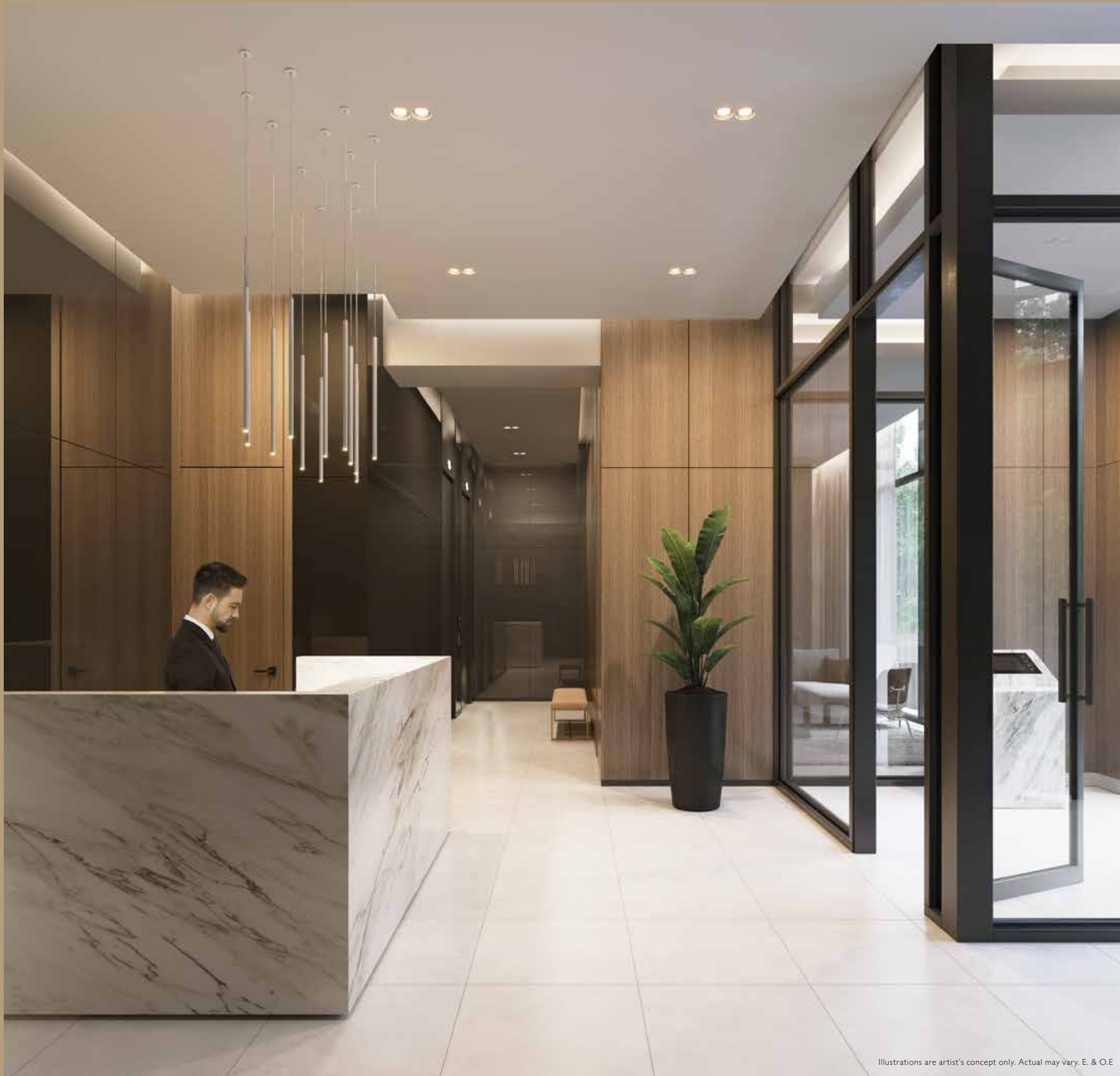
Illustrations are artist's concept only. Actual may vary. E. & O.E