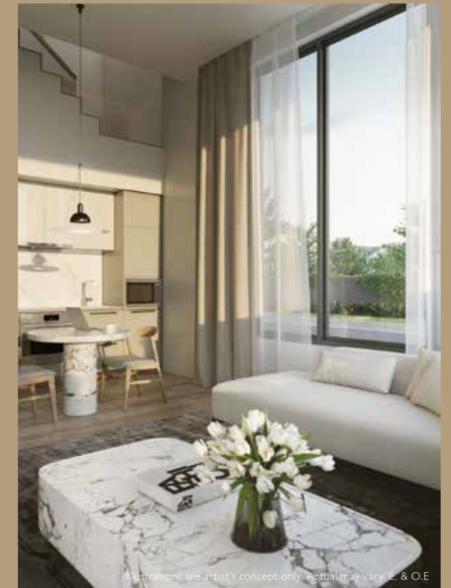
Illustrations are artist's concept only. Actual may vary. E. & O.E

Generous space considerations bestow a feeling of calm & freedom from cares. The primary bedroom bequeaths a journey of dreams enveloped in the utmost comfort.