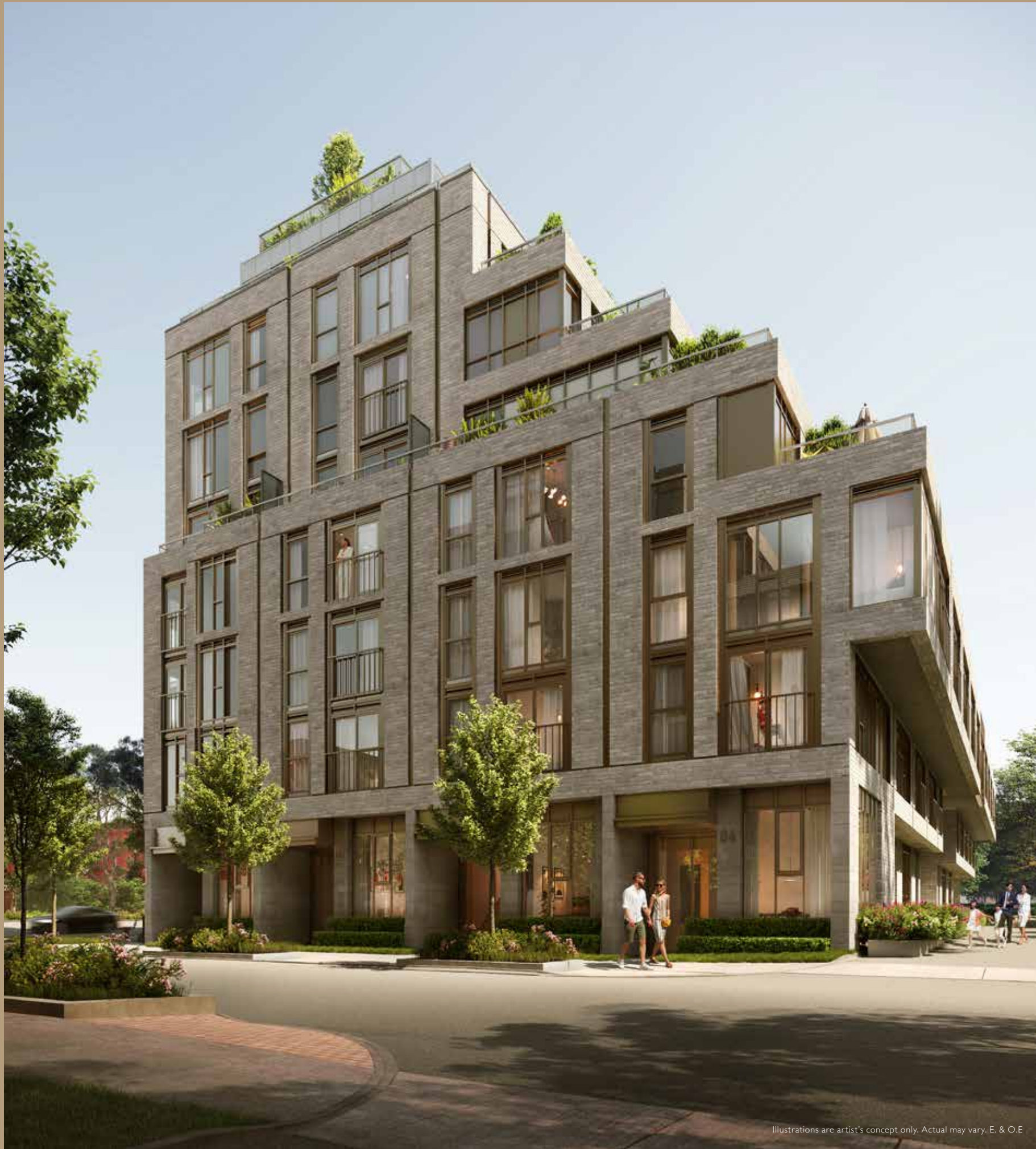
LEFT The Leaside

Welcome to The Leaside, a modern luxury boutique condominium by EMBLEM Developments, Core Development Group, and Fiera Real Estate making an eloquent statement of style and glamour in one of Toronto's most desirable neighbourhoods. Surrounded by parks and ravines, fine shopping and dining, renowned schools, and superb connectivity this distinctively designed midrise residence offers effortless sophistication. The lifestyle you have aspired to live is now within reach.