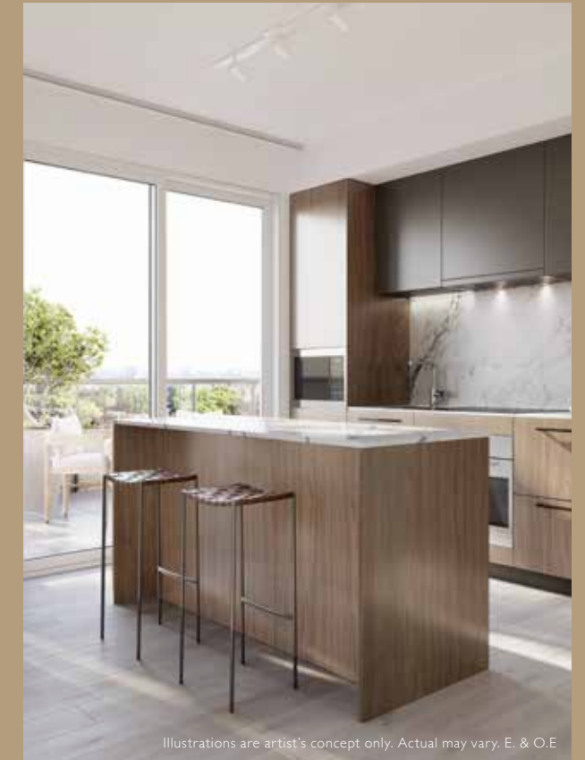
Illustrations are artist's concept only. Actual may vary. E. & O.E

Poised above the affluent neighbourhood of Leaside, the penthouses offer poetry embodied in views, space, & breathtaking design. Natural light flows in to bathe the open concept living area in a warm glow.