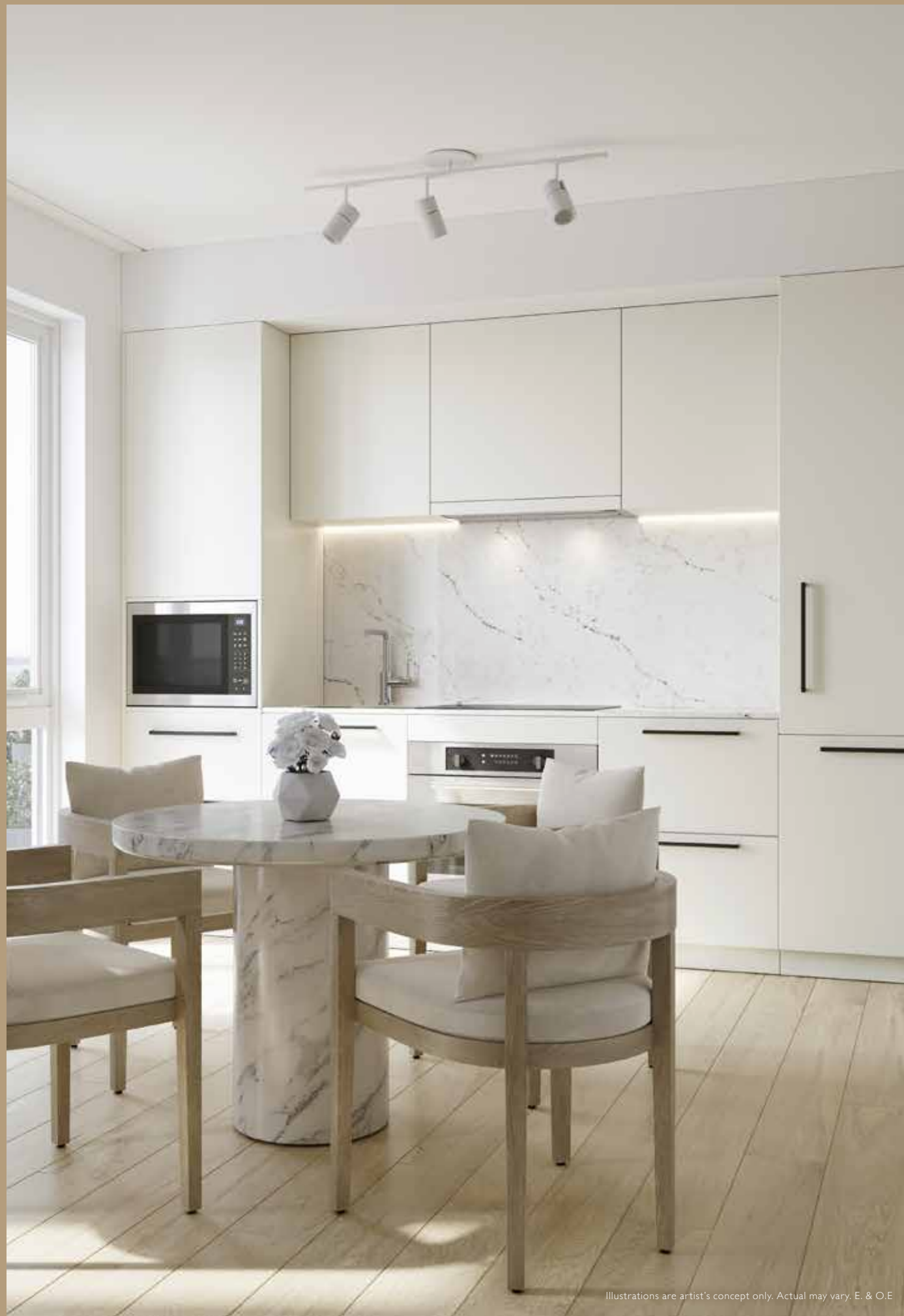
Illustrations are artist's concept only. Actual may vary. E. & O.E

Poised above the affluent neighbourhood of Leaside, the penthouses offer poetry embodied in views, space, & breathtaking design. Natural light flows in to bathe the open concept living area in a warm glow.