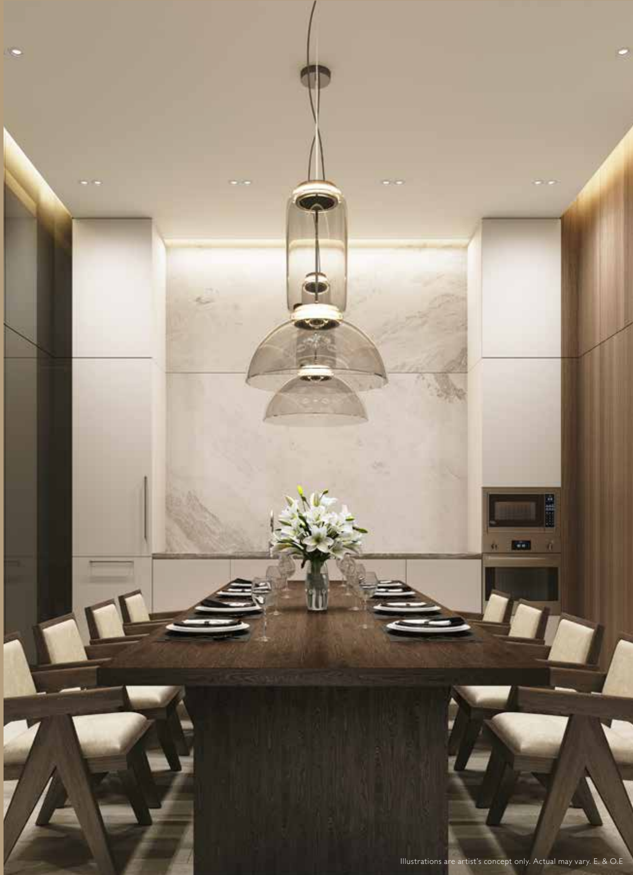
Illustrations are artist's concept only. Actual may vary. E. & O.E